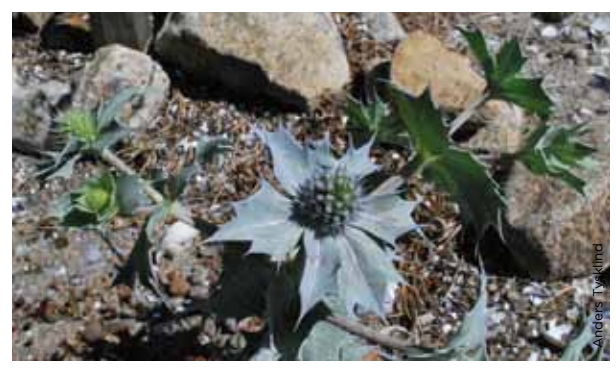
The thistle-like sea holly is a protected species and is rare on Saltö. The blue-green leaves have a waxy coating that protects them against the wind and salt-spray.

Lyme grass, sea lavender and sea holly grow on the sand and gravel beaches. They are hardy species that can tolerate the wind and salt-spray. In the sandy meadows look for catsfoot, milkwort and Nottingham catchfly, which grows in tufts and can be recognized by its white, deeply cleft petals.